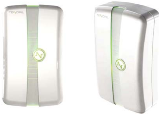
Tendril Volt (outlet)