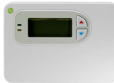
Tendril Set-Point (thermostat)