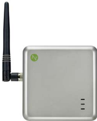
Tendril Transport (gateway)