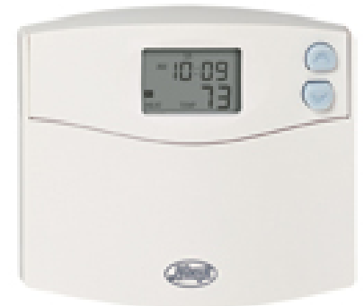
Third Party Smart Energy Devices