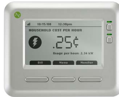
Tendril Insight (in-home display)